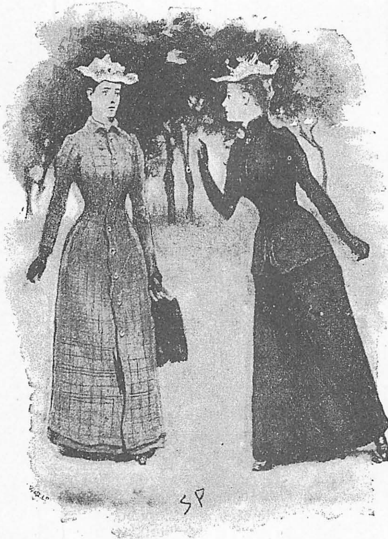
"SOME WOMAN CAME TALKING ABOUT LORD ST. SIMON."

mind to run away, and explain afterwards. I hadn't been at the table ten minutes before I saw Frank out of the window at the other side of the road. He beckoned to me, and then began walking into the Park. I slipped out, put on my things, and followed him. Some woman came talking