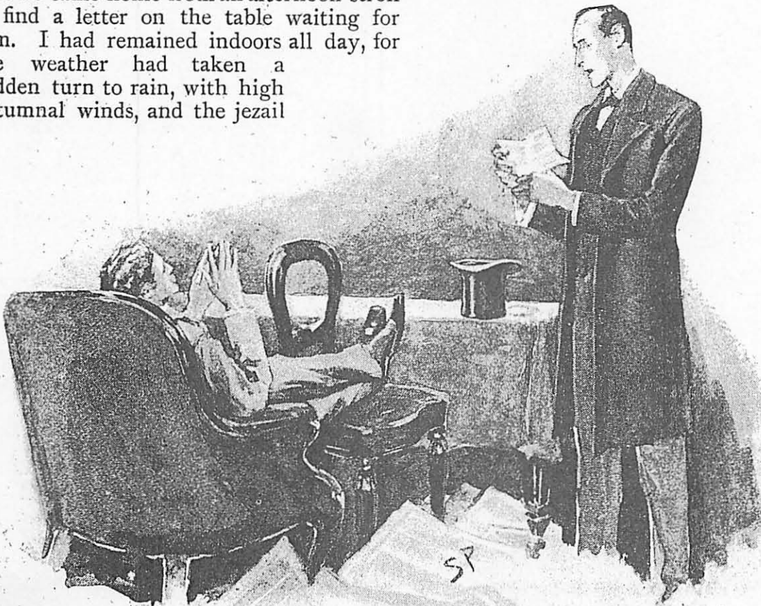
"HE BROKE THE SEAL AND GLANCED OVER THE CONTENTS."

"Yes, my correspondence has certainly the charm of variety," he answered, smiling, "and the humbler are usually the more interesting. This looks like one of those