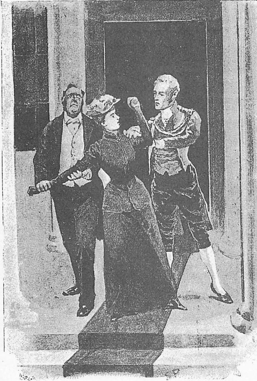
"SHE WAS EJECTED BY THE BUTLER AND THE FOOTMAN."

bably result in a speedy clearing up of this very singular business. Up to a late hour last night, however, nothing had transpired as to the whereabouts of the missing lady. There are rumours of foul play in the matter, and it is said that the police have caused the arrest of the woman who had caused the original disturbance, in the belief that, from jealousy or some other motive, she may have been concerned in the strange disappearance of the bride."