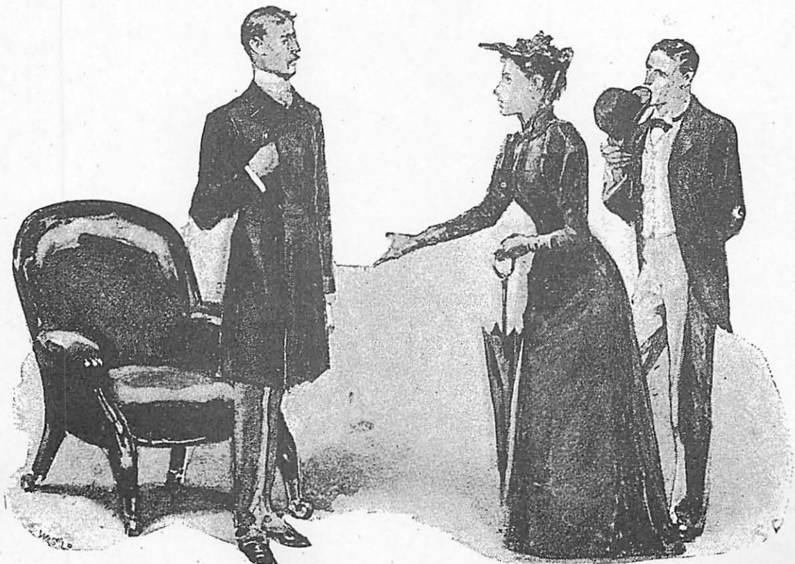
"A PICTURE OF OFFENDED DIGNITY."

At the sight of these new-comers our client had sprung from his seat, and stood very erect, with his eyes cast down and his hand thrust into the breast of his frock coat, a picture of offended dignity. The lady had taken a quick step forward and had held out her hand to him, but he still refused