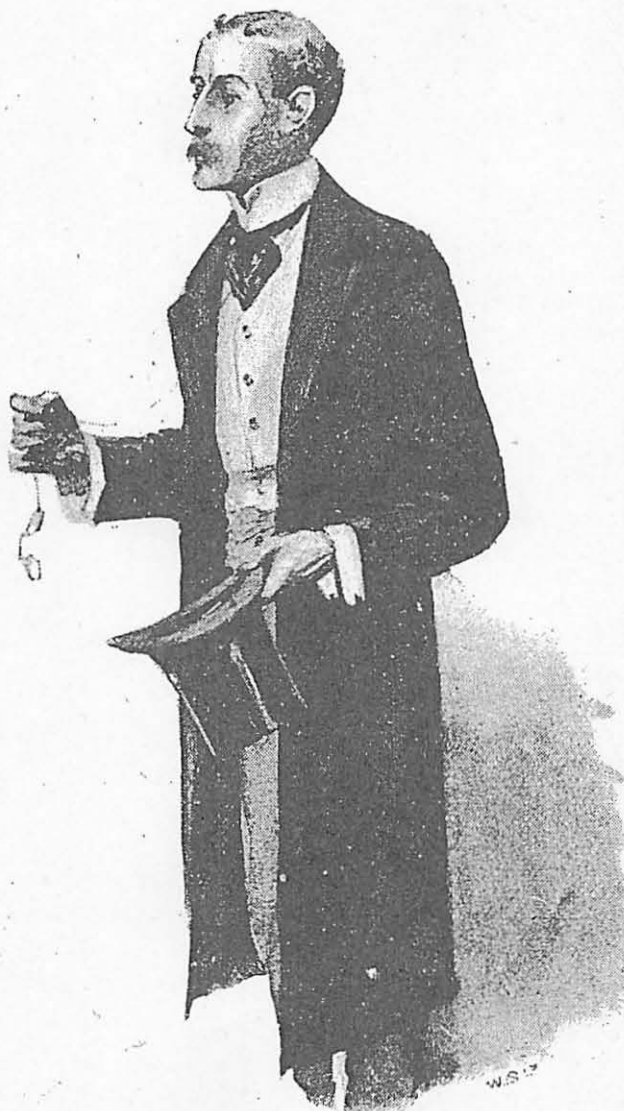
"LORD ROBERT ST. SIMON."

"I brought this with me." He opened a locket, and showed us the full face of a very lovely woman. It was not a photograph, but an ivory miniature, and the artist had brought out the full effect of the lustrous black hair, the large dark eyes, and the exquisite mouth. Holmes gazed long and earnestly at it. Then he closed the