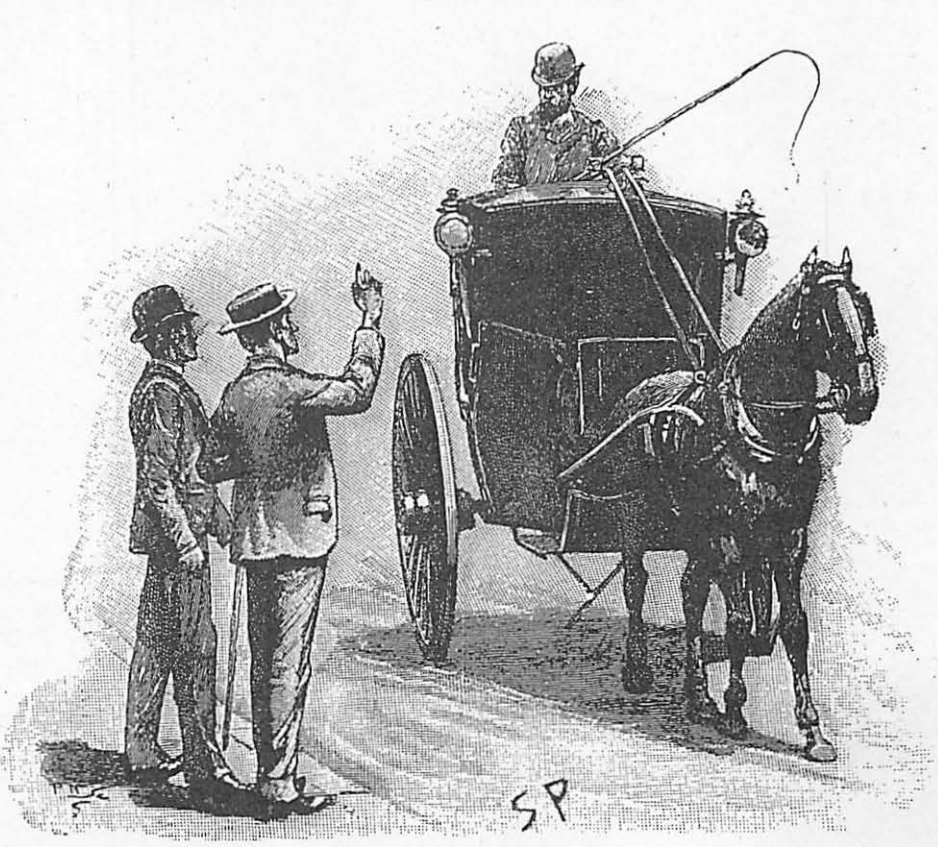
" HOW FAR TO WALLINGTON ?"