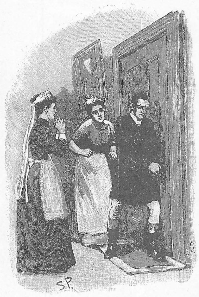
"THE COACHMAN RUSHED TO THE DOOR."

sudden thought struck him, however, and he ran through the hall door and round to the lawn, upon which the long French windows open. One side of the window was open, which I understand was quite usual in the summer-time, and he passed without difficulty into the room. His mistress had ceased to scream, and was stretched insensible upon a couch, while with his feet tilted over the side of an arm-chair, and his head upon the ground near the corner of the fender, was lying the unfortunate soldier, stone dead, in a pool of his own blood.