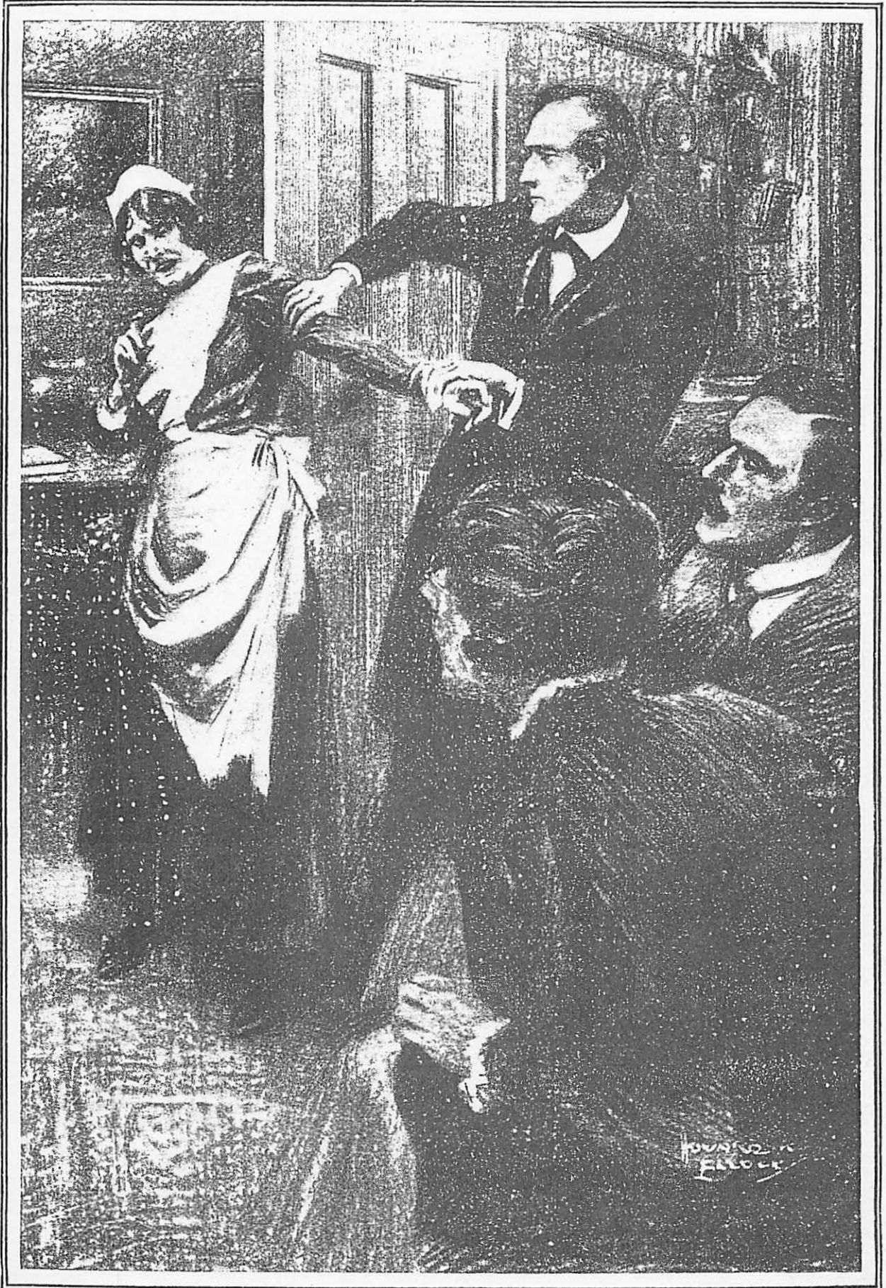
Holmes flung open the door and dragged in a great gaunt woman whom he had seized by the shoulder.