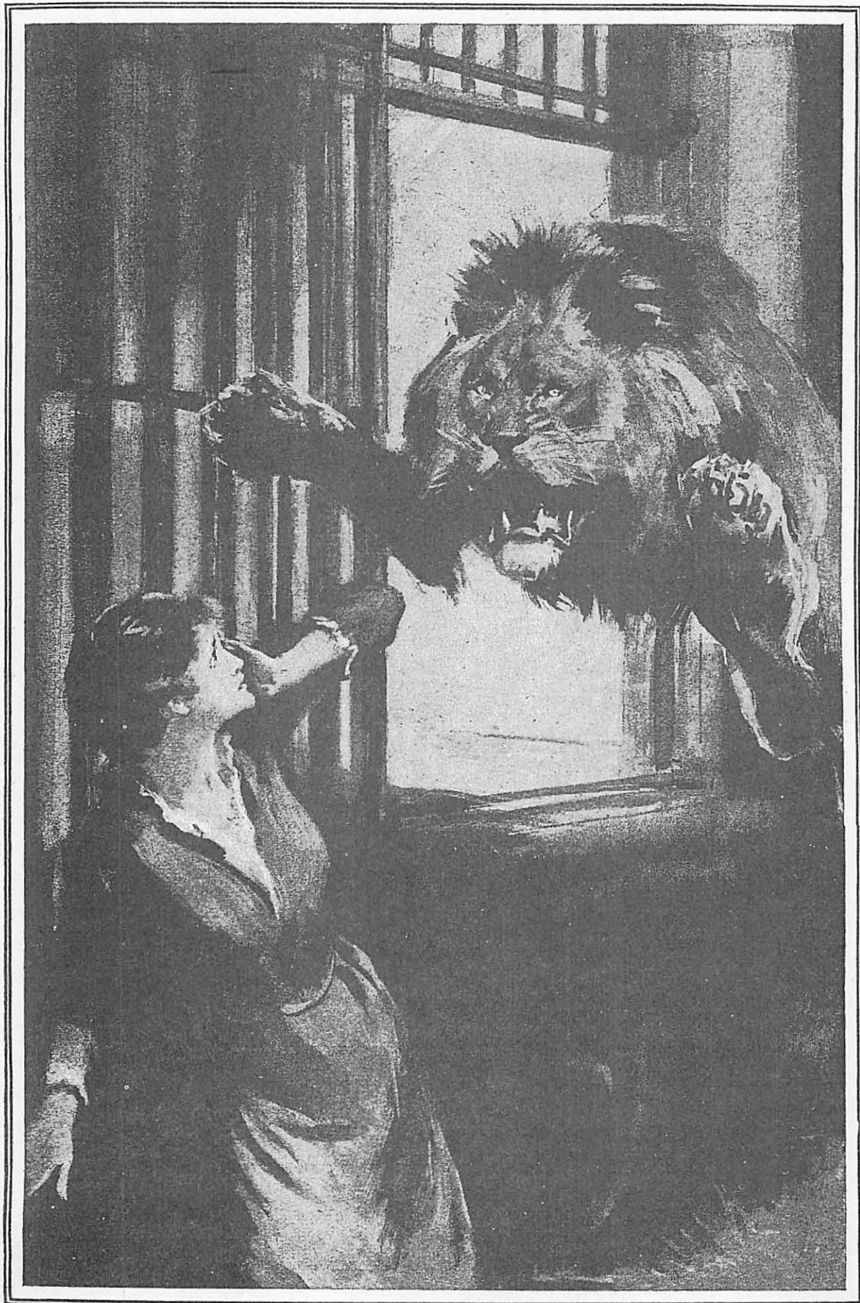
' AS I SLIPPED THE BARS THE LION BOUNDED OUT, AND WAS ON ME IN AN INSTANT.'