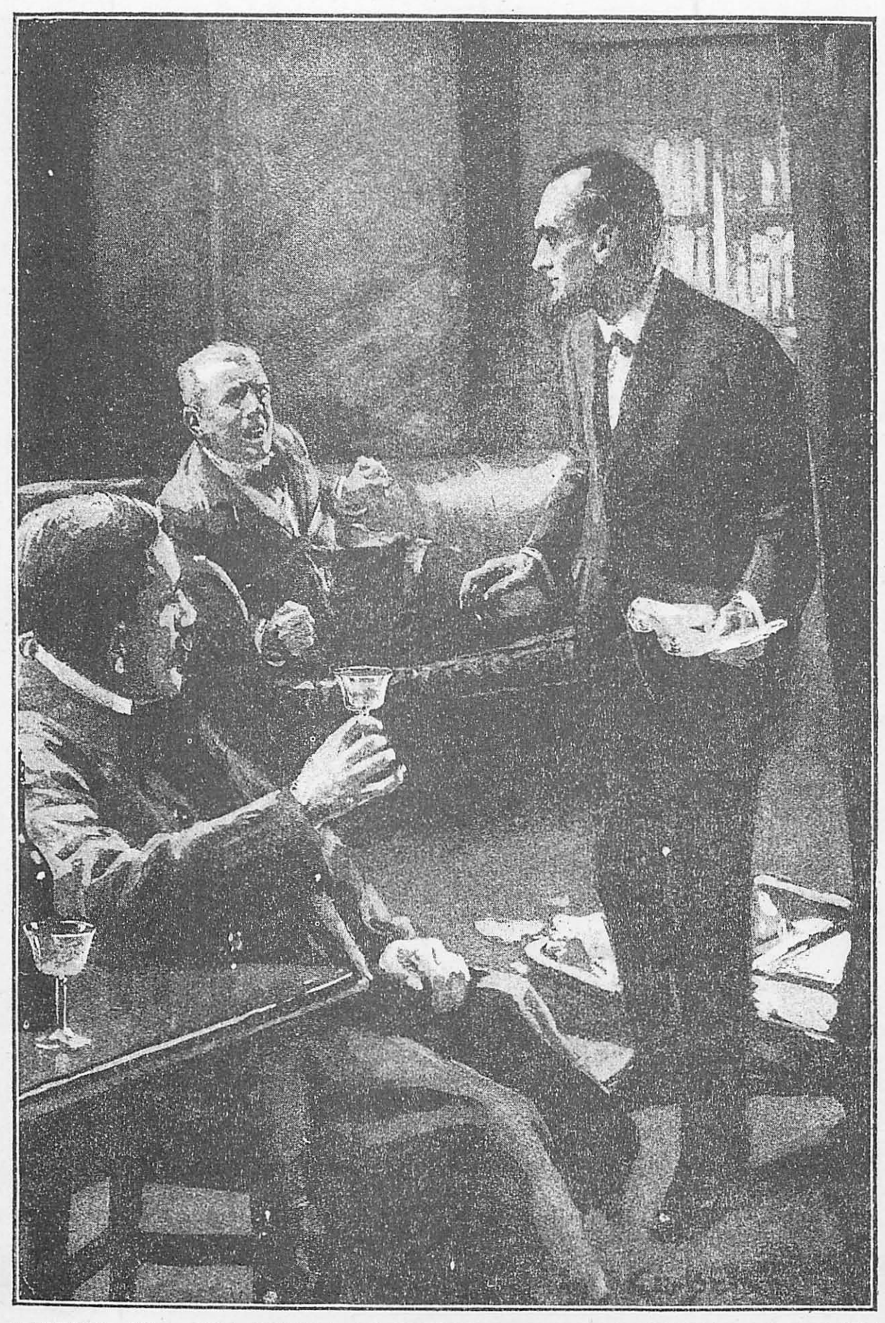
"'CURSE YOU, YOU DOUBLE TRAITOR!' CRIED THE GERMAN, STRAINING AGAINST HIS BONDS AND GLARING MURDER FROM HIS FURIOUS EYES."