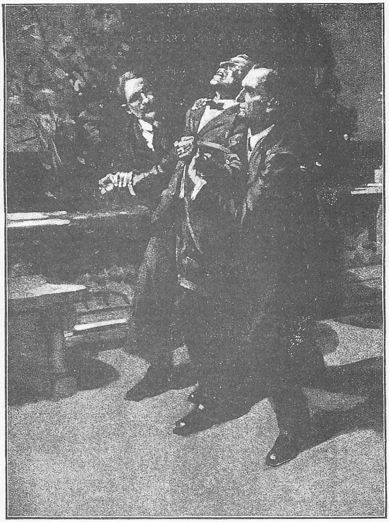
"HOLDING EITHER ARM, THE TWO FRIENDS WALKED HIM VERY SLOWLY DOWN THE GARDEN PATH."

no existence in fact. He was a concoction, a myth, an isolated strand from my bundle of personalities. I used him and he is gone." "Then who are you?"