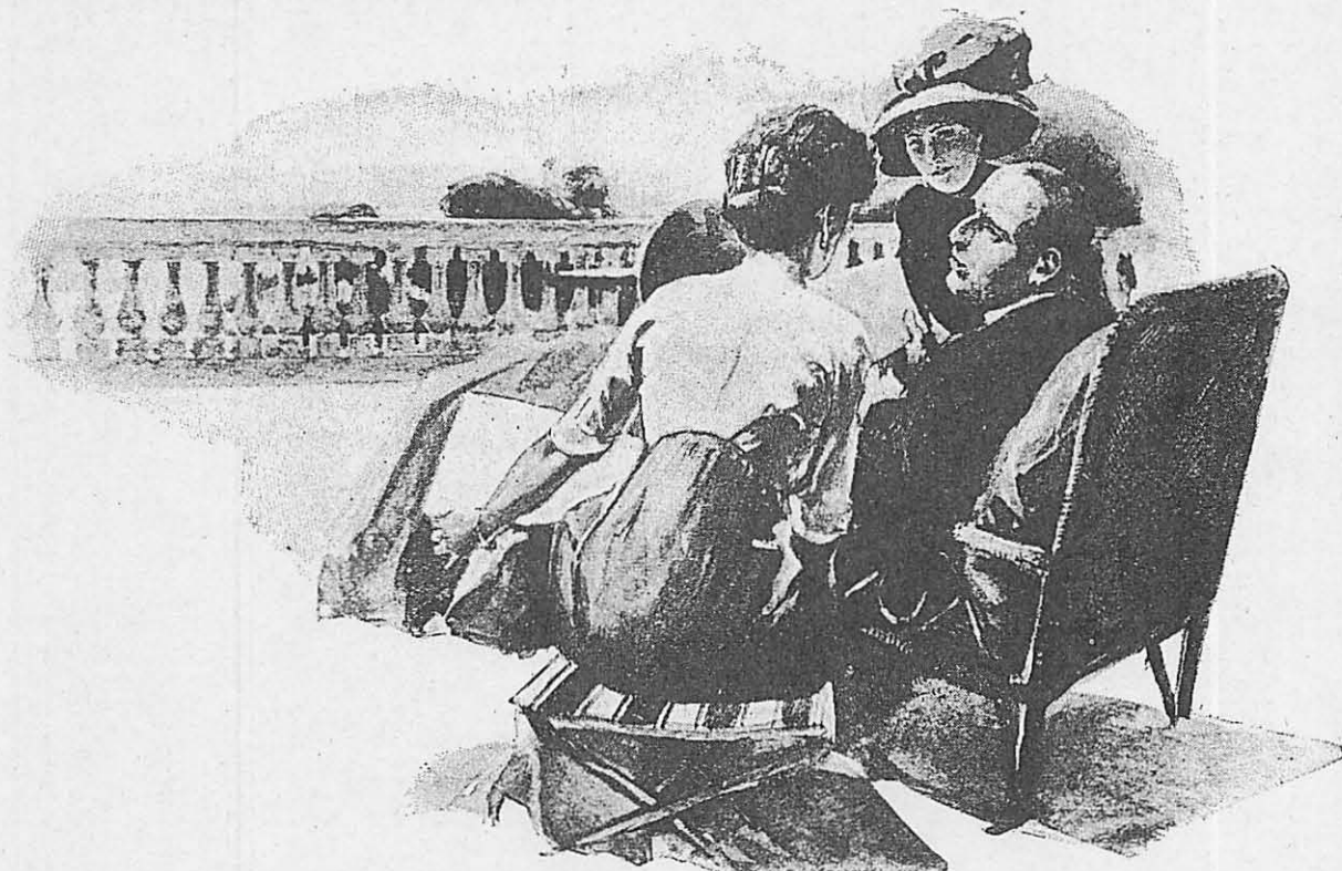
"HE SPENT HIS DAY UPON A LOUNGE-CHAIR ON THE VERANDA, WITH AN ATTENDANT LADY UPON EITHER SIDE OF HIM."

At Baden the track was not difficult to follow. Lady Frances had stayed at the Englischer Hof for a fortnight. Whilst there she had made the acquaintance of a Dr. Shlessinger and his wife, a missionary from South America. Like most lonely ladies, Lady Frances found her comfort and occupation in religion. Dr. Shlessinger's remarkable personality, his whole-hearted devotion, and the fact that he was recovering from a disease contracted in the exercise of his