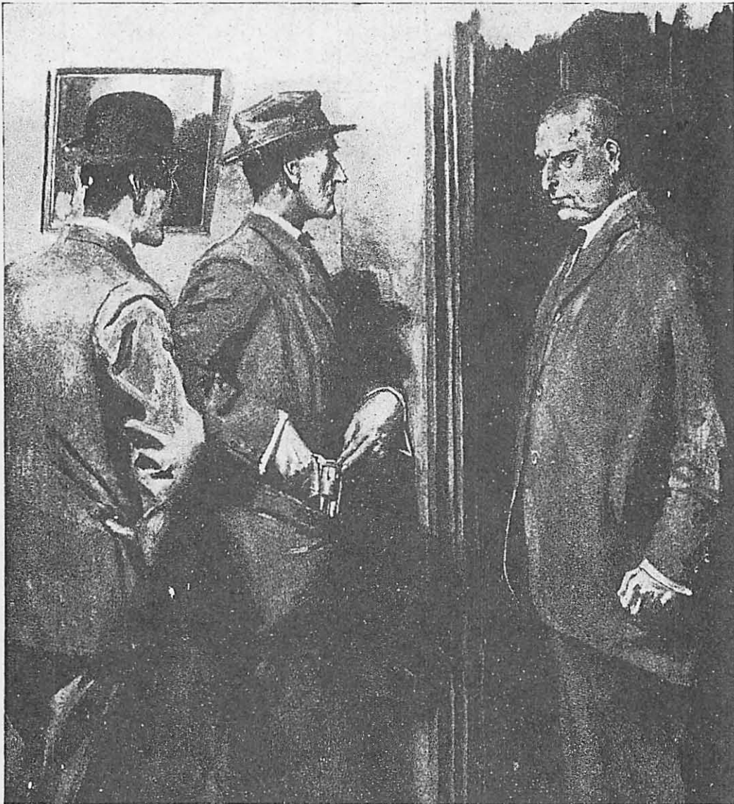
"HOLMES HALF DREW A REVOLVER FROM HIS POCKET."

to Mrs. Peters and me at Baden (it is a fact that I was using another name at the time), and she stuck on to us until we came to London. I paid her bill and her ticket. Once in London, she gave us the slip, and, as I say, left these out-of-date jewels to pay her bills. You find her, Mr. Holmes, and I'm your debtor."