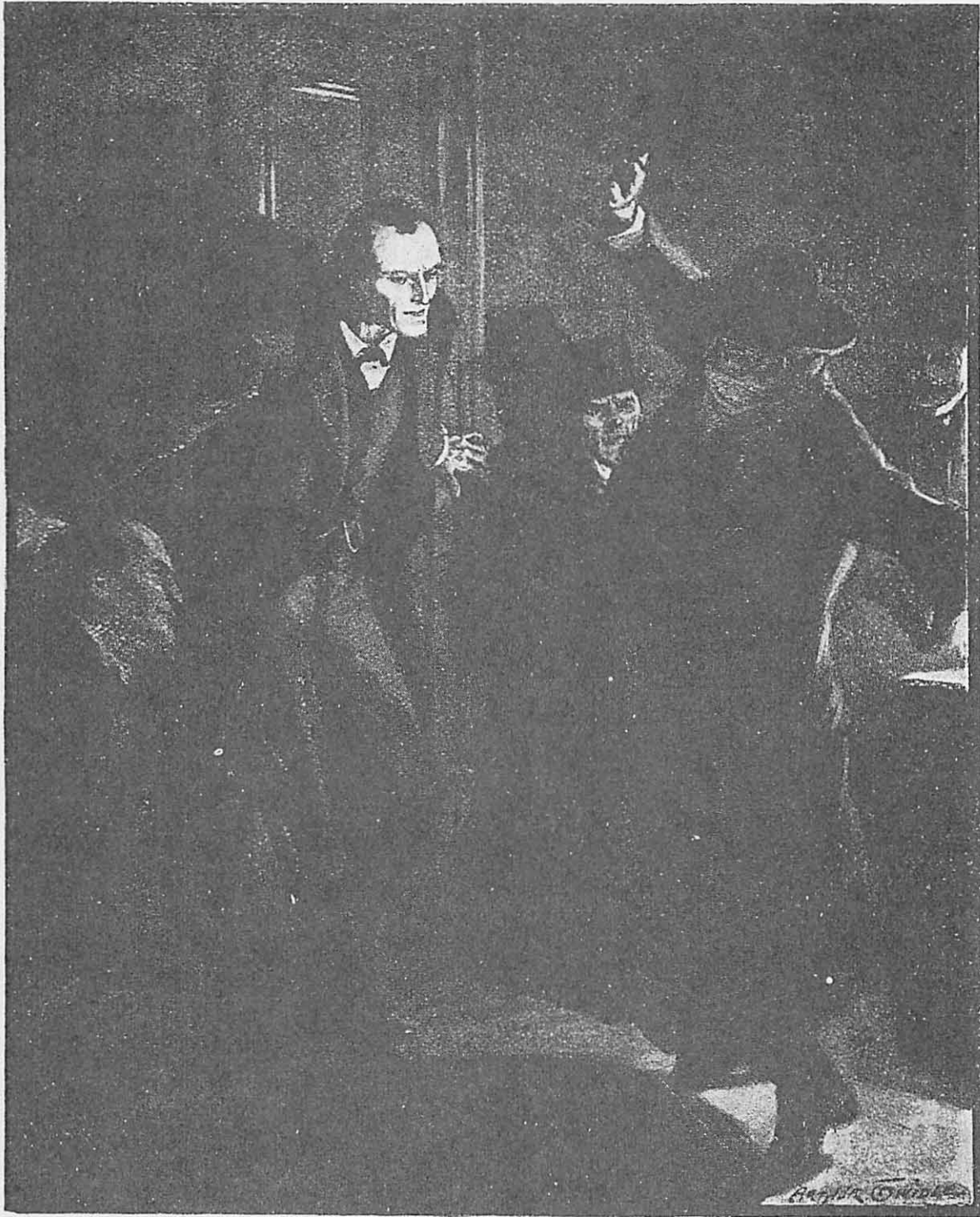
"BEFORE OUR PRISONER HAD RECOVERED HIS BALANCE THE DOOR WAS SHUT AND HOLMES STANDING WITH HIS BACK AGAINST IT."

it. The man glared round him, staggered, and fell senseless upon the floor. With the shock, his broad-brimmed hat flew from his head, his cravat slipped down from his lips, and there was the long light beard and the soft, handsome, delicate features of Colonel Valentine Walter.