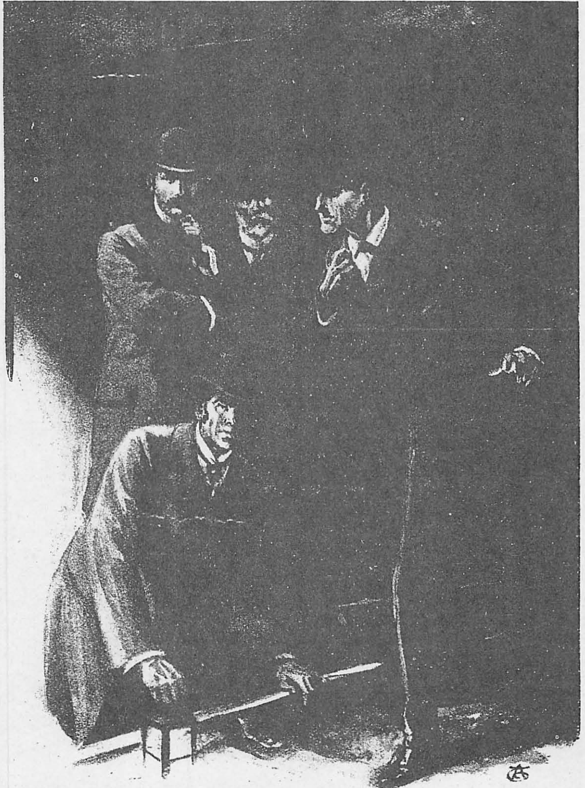
"MY FRIEND WAS STANDING WITH AN EXPRESSION OF STRAINED INTENSITY UPON HIS FACE."

My friend was standing with an expression of strained intensity upon his face, staring at