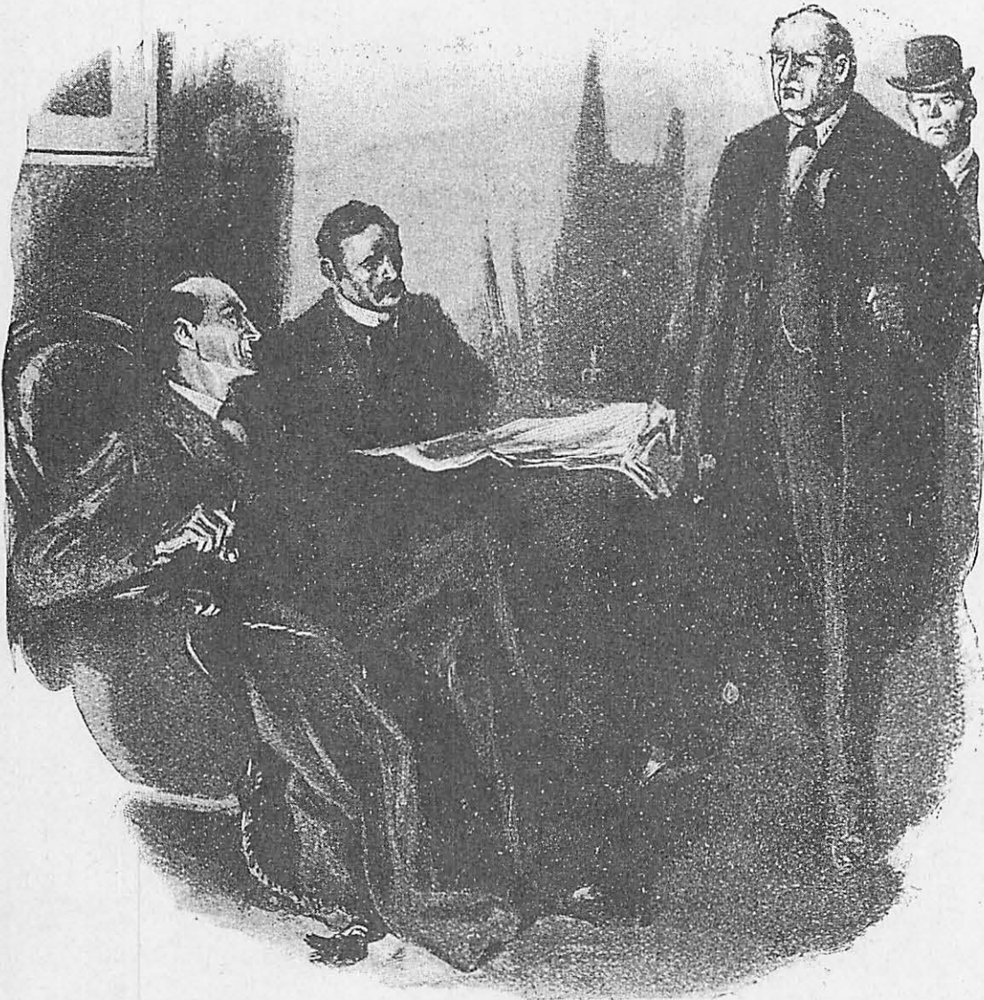
"THE TALL AND PORTLY FORM OF MYCROFT HOLMES WAS USHERED INTO THE ROOM."

"A most annoying business, Sherlock," said he. "I extremely dislike altering my habits, but the powers that be would take no denial. In the present state of Siam it is most awkward that I should be away from the office. But it is a real crisis. I have never seen the Prime Minister so upset. As