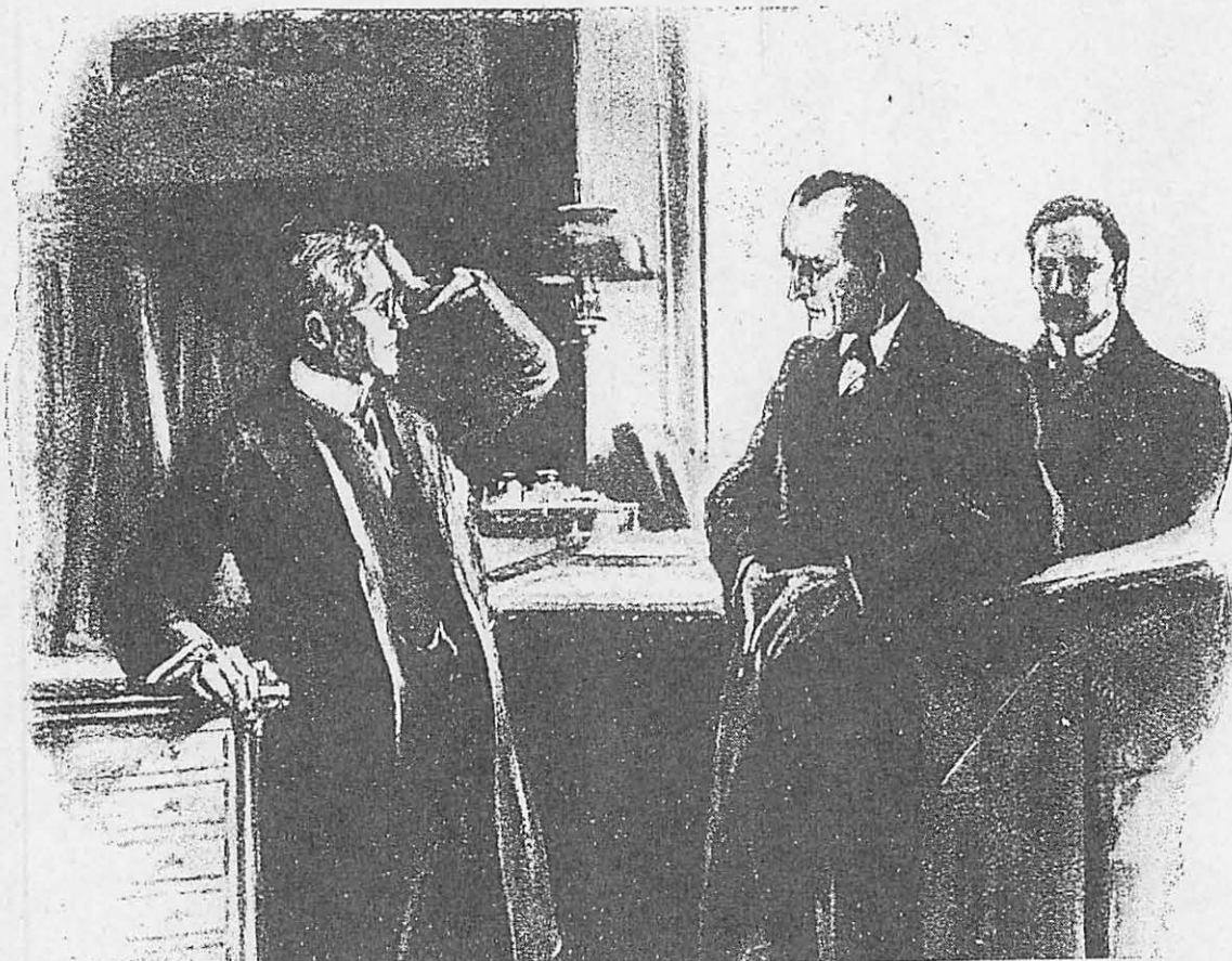
"DO YOU MEAN TO SAY THAT ANYONE HOLDING THESE THREE PAPERS, AND WITHOUT THE SEVEN OTHERS, COULD CONSTRUCT A BRUCE-PARTINGTON SUBMARINE?"

they could not make the boat. Of course, they might soon get over the difficulty."