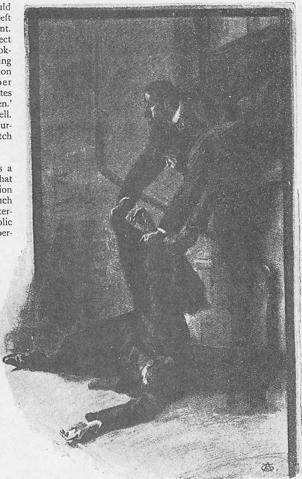
"THAT WAS THE END OF THE MATTER."

Colonel Walter died in prison towards the end of the second year of his sentence. As to Holmes, he returned refreshed to his monograph upon the Polyphonic Motets of Lassus, which has since been printed for private circulation, and is said by experts to be the last word upon the subject. Some weeks afterwards I learned incidentally that my friend spent a day at Windsor, whence he returned with a remarkably fine emerald tie-pin. When I asked him if he had bought it, he answered that it was a