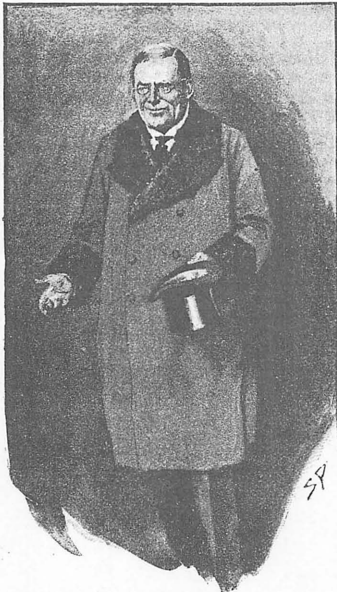
"CHARLES AUGUSTUS MILVERTON."

"My dear sir, it is painful to me to discuss it; but if the money is not paid on the 14th there certainly will be no marriage on the 18th." His insufferable smile was more complacent than ever.