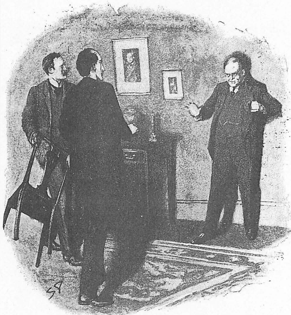
"EXHIBITING THE BUTT OF A LARGE REVOLVER, WHICH PROJECTED FROM THE INSIDE POCKET."

and it is a long drive to Hampstead." He stepped forward, took up his coat, laid his hand on his revolver, and turned to the door. I picked up a chair, but Holmes shook his head and I laid it down again. With a bow, a smile, and a twinkle Milverton was out of the room, and a few moments after we heard the slam of the carriage door and the rattle of the wheels as he drove away.