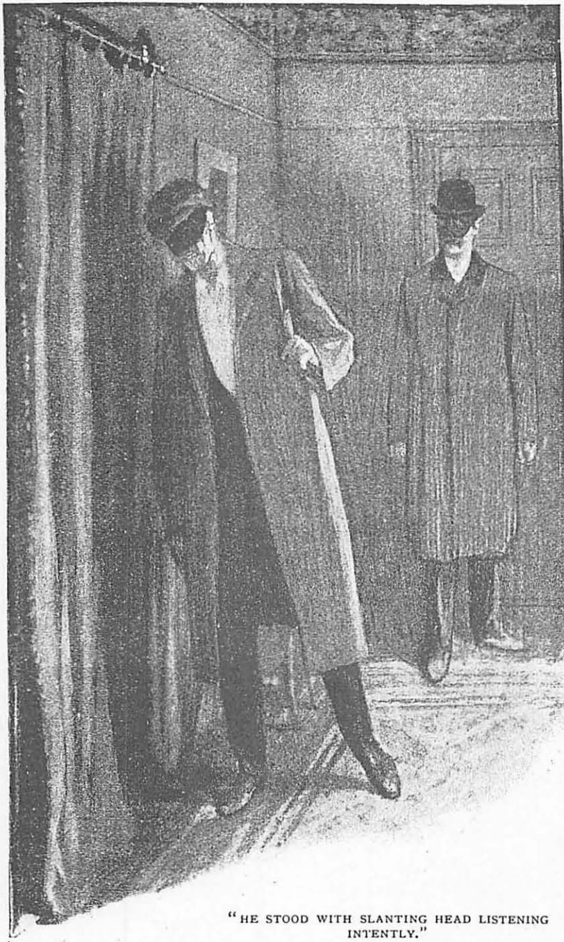
"HE STOOD WITH SLANTING HEAD LISTENING INTENTLY."

confronted with this green and gold monster, the dragon which held in its maw the reputations of many fair ladies. Turning up the cuffs of his dress-coat—he had placed his overcoat on a chair—Holmes laid out two drills, a jemmy, and several skeleton keys. I stood at the centre door with my eyes glancing at each of the others, ready for any emergency; though, indeed, my plans were somewhat vague as to what I should do if we were interrupted. For half an hour Holmes worked with concentrated energy, laying down one tool, picking up another, handling each with the strength and delicacy of the trained mechanic. Finally I heard a click, the broad green door swung open, and inside I had a glimpse of a number of paper packets, each tied, sealed, and inscribed.