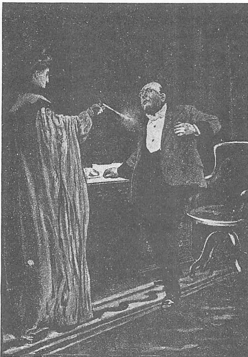
"THEN HE STAGGERED TO HIS FEET AND RECEIVED ANOTHER SHOT."

wall which barred our path, but he sprang to the top and over. As I did the same I felt the hand of the man behind me grab at my ankle; but I kicked myself free and scrambled over a glass-strewn coping. I fell upon my face among some bushes; but Holmes had me on my feet in an instant, and together we dashed away across the huge expanse of Hampstead Heath. We had run two miles, I suppose, before Holmes at last halted and listened intently. All was absolute silence behind us. We had shaken off our pursuers and were safe.