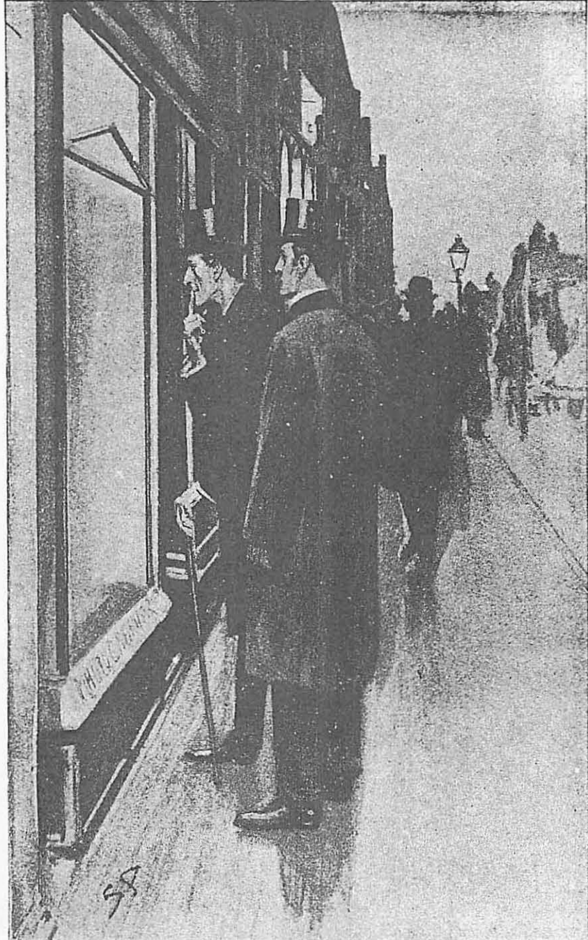
"FOLLOWING HIS GAZE I SAW THE PICTURE OF A REGAL AND STATELY LADY IN COURT DRESS."

Regent Circus. Here on the left hand there stands a shop window filled with photographs of the celebrities and beauties of the day. Holmes's eyes fixed themselves upon one of them, and following his gaze I saw the picture of a regal and stately lady in Court dress, with a high diamond tiara upon her noble head. I looked at that delicately-curved nose, at the marked eyebrows, at the straight mouth, and the strong little chin