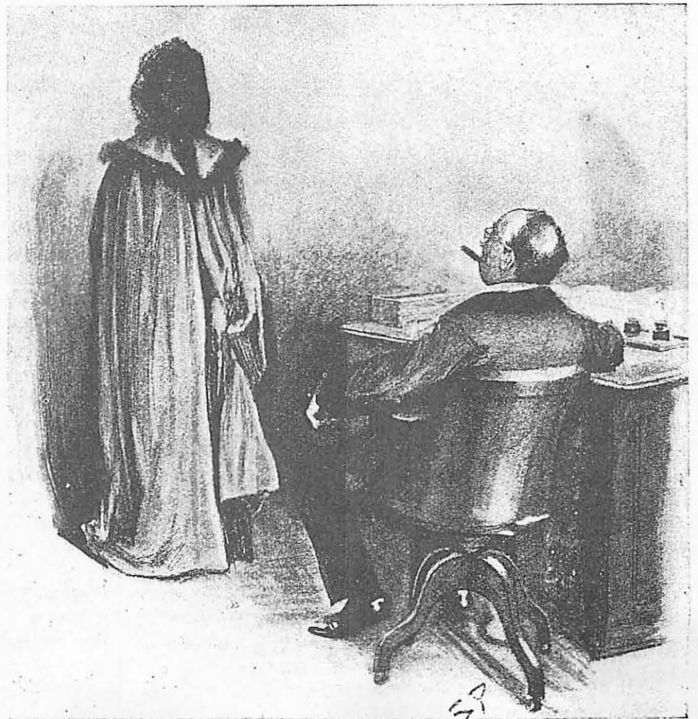
"YOU COULDN'T COME ANY OTHER TIME—EH?"

"Well," said Milverton, "you've made me lose a good night's rest, my dear. I hope you'll prove worth it. You couldn't come any other time—eh?"