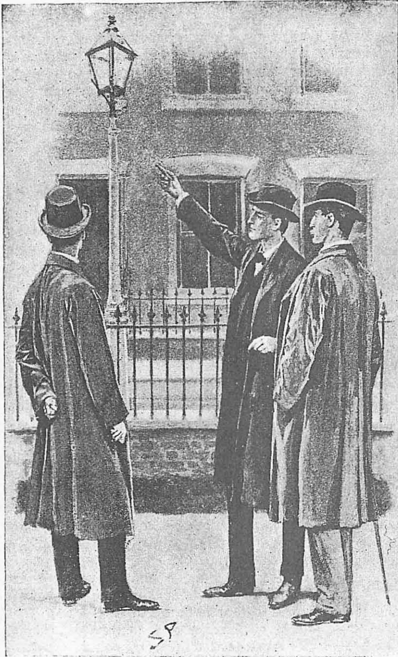
"HOLMES POINTED TO THE STREET LAMP ABOVE OUR HEADS."

last night, and who it was who met him and killed him on the doorstep of Mr. Horace Harker. Don't you think so?"