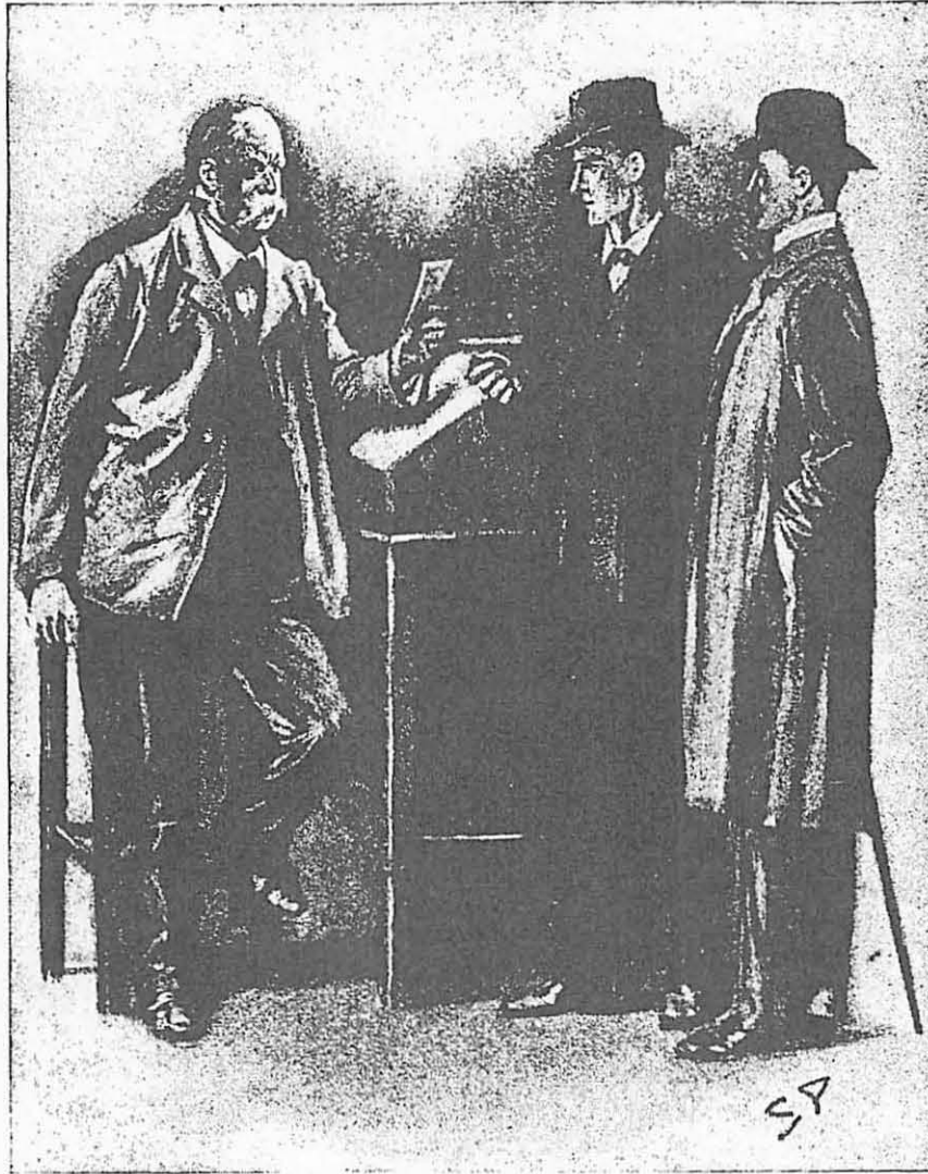
“AH, THE RASCAL!” HE CRIED.”

were occupied with a highly sensational and flowery rendering of the whole incident. Holmes propped it against the cruet-stand and read it while he ate. Once or twice he chuckled.