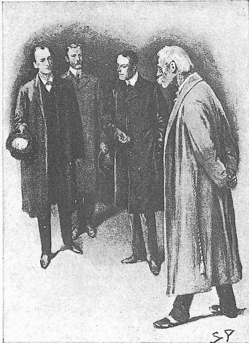
"HE WAS INTRODUCED TO US AS THE OWNER OF THE HOUSE—MR. HORACE HARKER."

came from outside. Then suddenly, about five minutes later, there came a most horrible yell—the most dreadful sound, Mr. Holmes, that ever I heard. It will ring in my ears as long as I live. I sat frozen with horror for