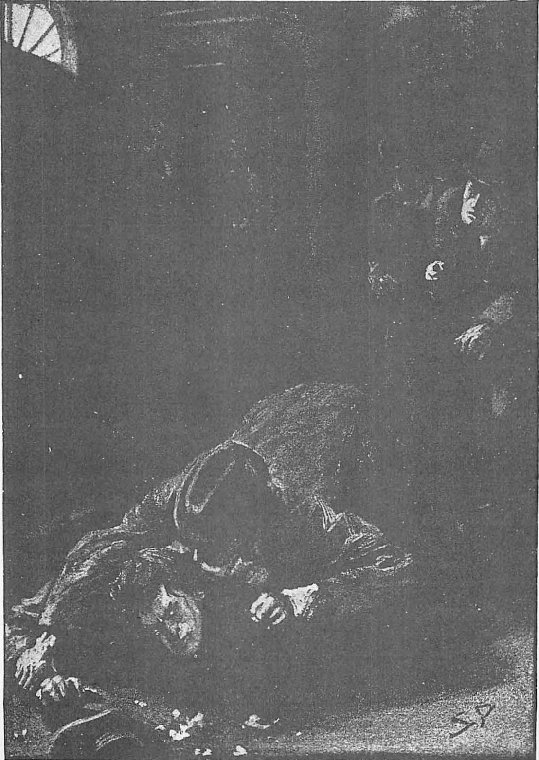
“WITH THE BOUND OF A TIGER HOLMES WAS ON HIS BACK.”