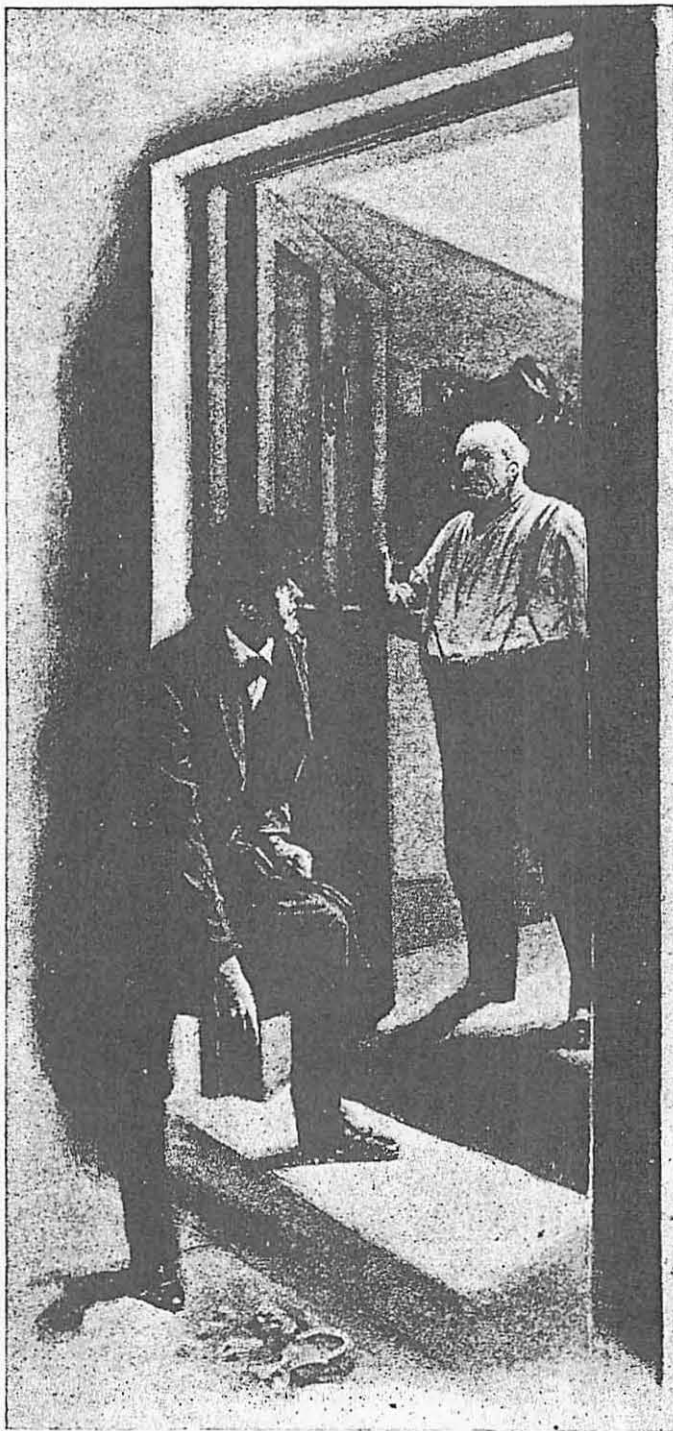
"THE DOOR OPENED, AND THE OWNER OF THE HOUSE PRESENTED HIMSELF."

But it was not our prisoner to whom Holmes was giving his attention. Squatted on the doorstep, he was engaged in most carefully examining that which the man had brought from the house. It was a bust of