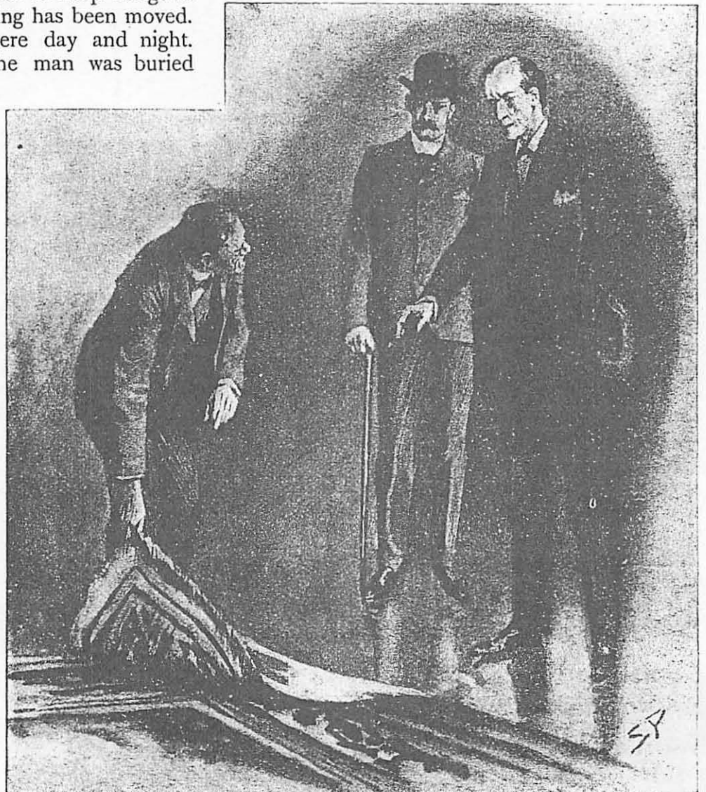
"HE TOOK THE CORNER OF THE CARPET IN HIS HAND."

"Why, it is simple enough. The two stains did correspond, but the carpet has