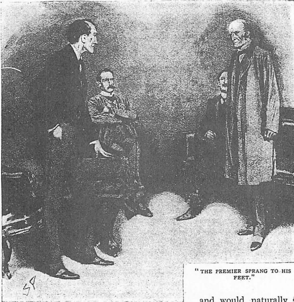
"THE PREMIER SPRANG TO HIS FEET."

balance of military power. Great Britain holds the scales. If Britain were driven into war with one confederacy, it would assure the supremacy of the other confederacy, whether they joined in the war or not. Do you follow?"