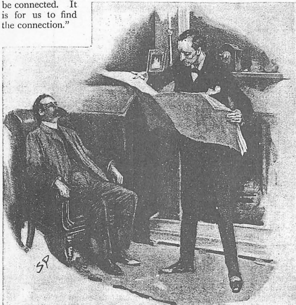
"MY DEAR WATSON, THE TWO EVENTS ARE CONNECTED—MUST BE CONNECTED."

actors in this drama, and he meets a violent death during the very hours when we know that that drama was being enacted. The odds are enormous against its being coincidence. No figures could express them. No, my dear Watson, the two events are connected — must be connected. It is for us to find the connection."