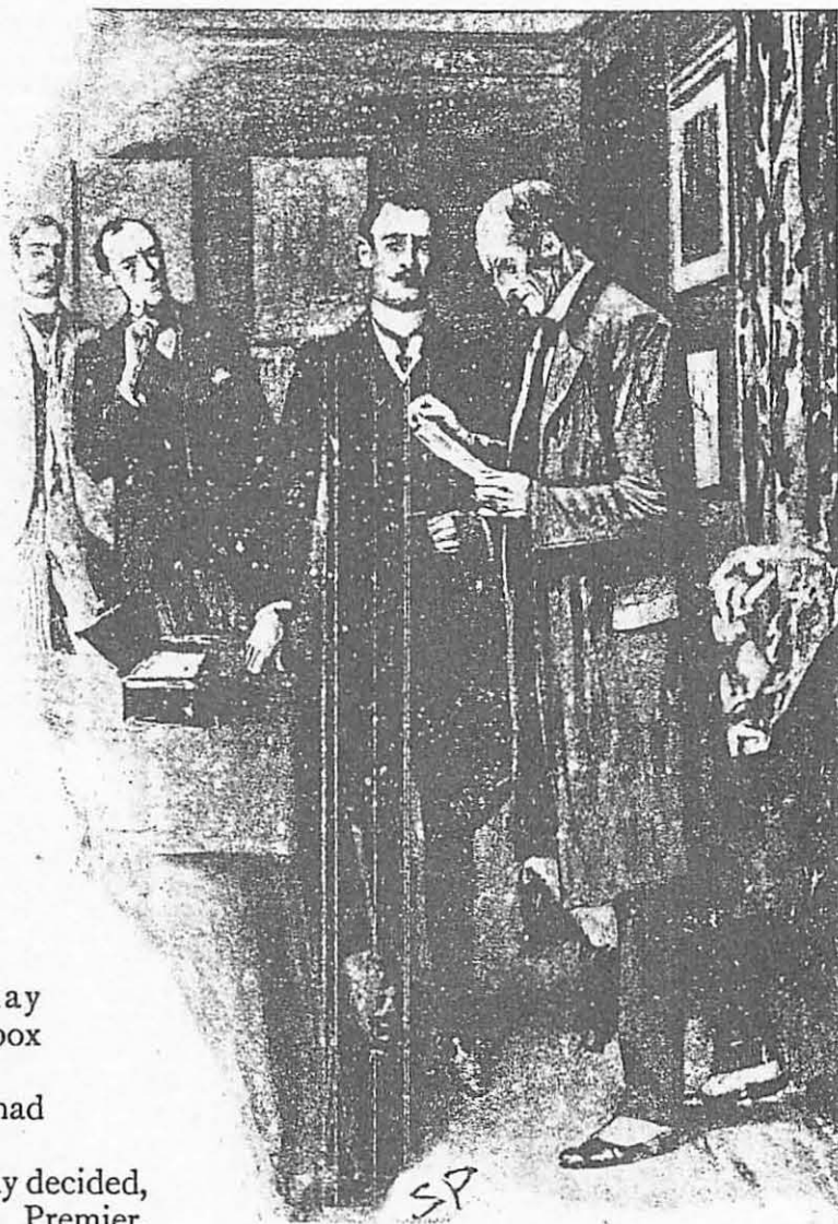
"THE PREMIER SNATCHED THE BLUE ENVELOPE FROM HIS HAND."

"We also have our diplomatic secrets," said he, and picking up his hat he turned to the door.