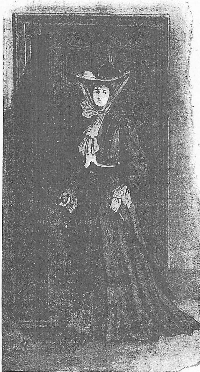
"SHE LOOKED BACK AT US FROM THE DOOR."