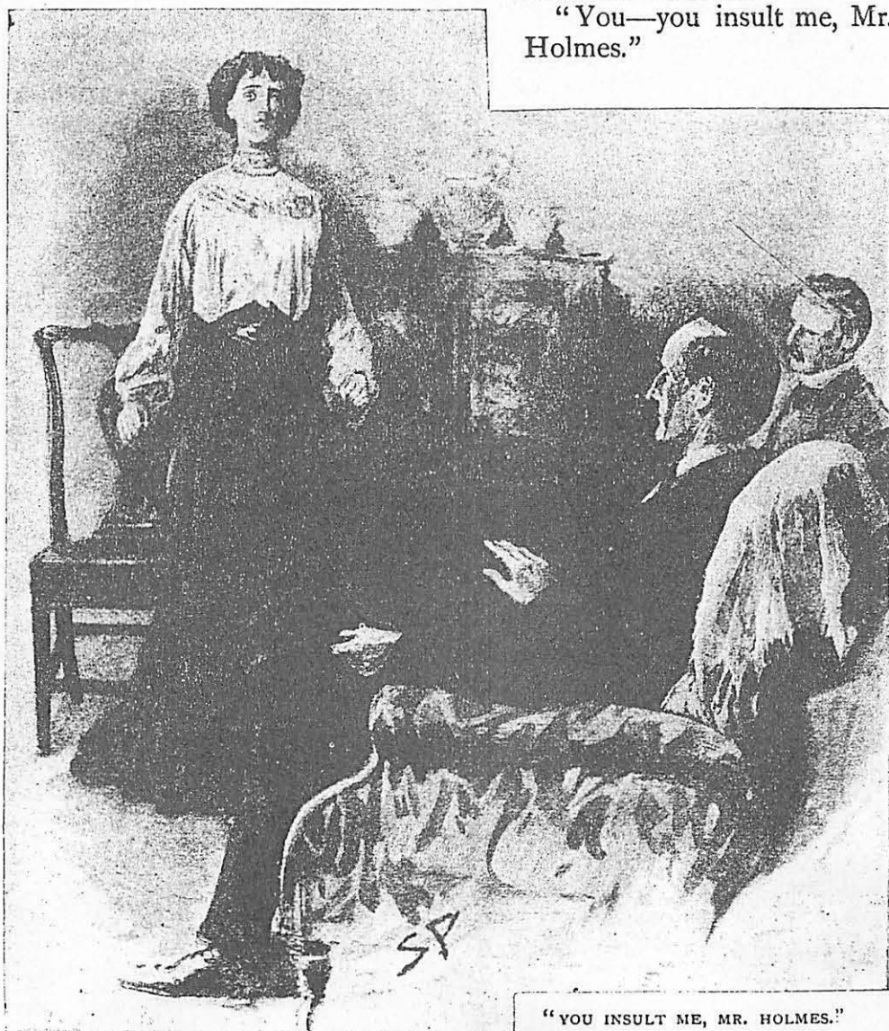
"YOU INSULT ME, MR. HOLMES."